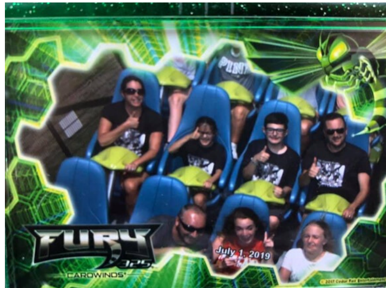
The Simpson family enjoying Fury 325 at Carowinds.